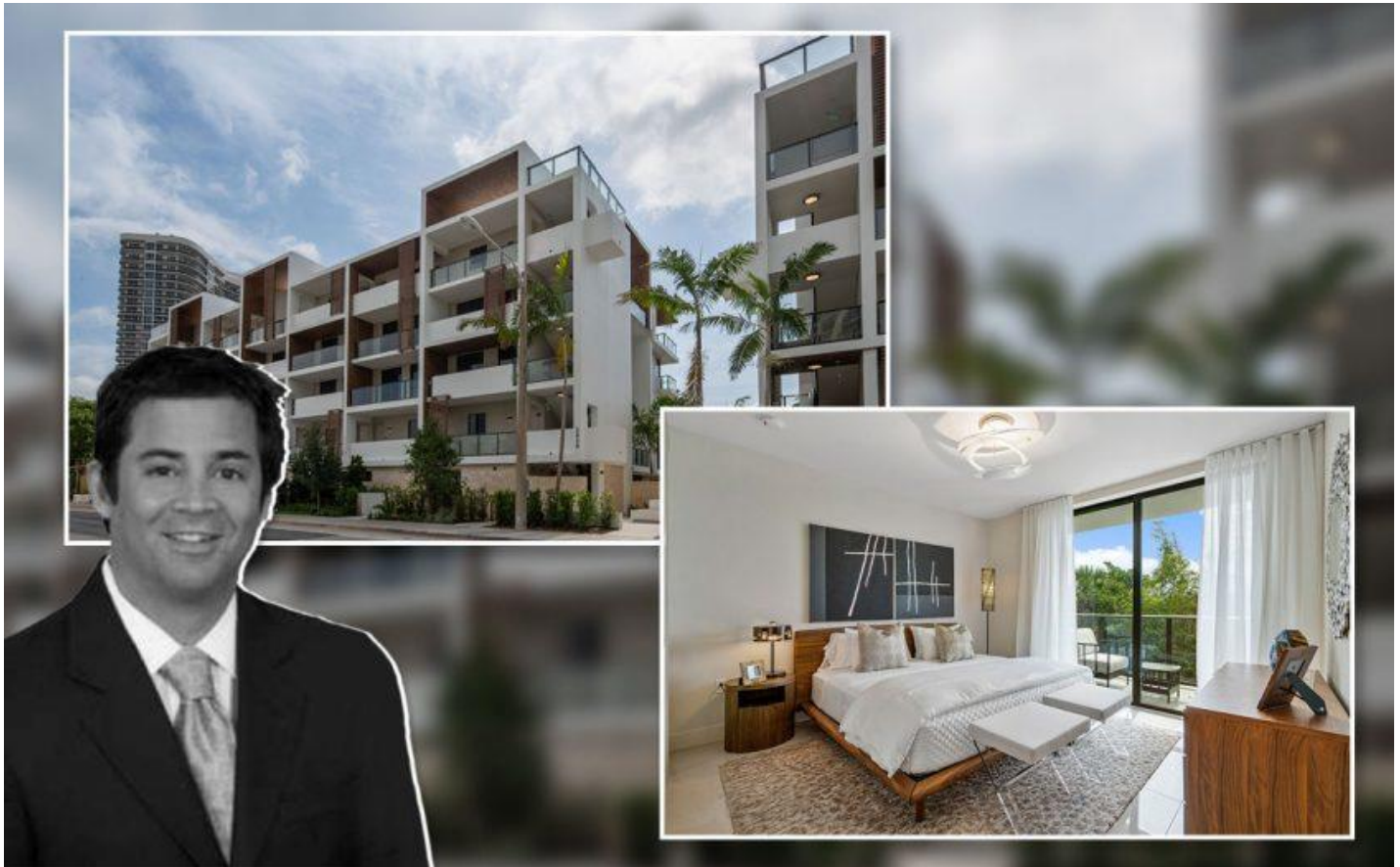
Adam Adache and renderings of 30 Thirty North Ocean

30 Thirty North Ocean, a boutique condominium development in Fort Lauderdale